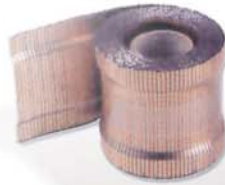
| G-CR 11/95 R