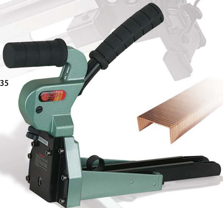
| G-CM 19/35