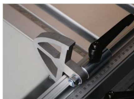
Tope palograma Fence flip stop Buté palograme