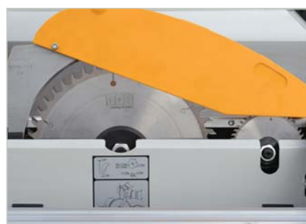
Sierra circular grupo incisor Circular saw scoring group Scie circulaire groupe inciseur