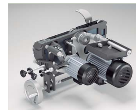
Grupo Group Groupe