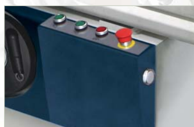
Panel de control Control panel Tableau de contrôle