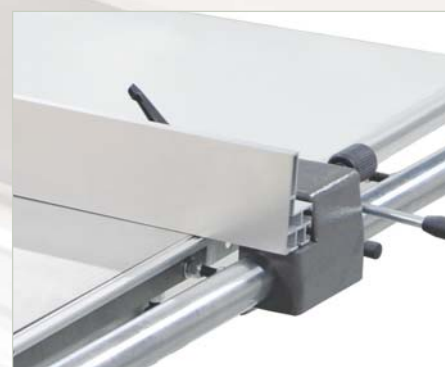
Corte paralelo Cutting width Coupe parallèle